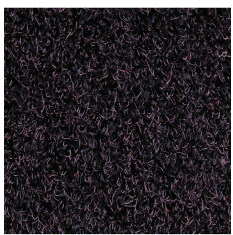
03. Brown SYN0311