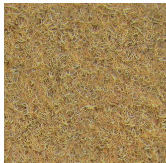
01. Natural SYN0111