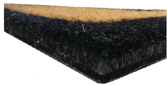
Crumb Rubber Backing